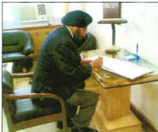
After assuming charge of GOC 15 Corps, Lt. General Bikram Singh AVSM, SM, VSM made a courtesy call to DGP J&K on November 25, 2008 at PHQ Jammu