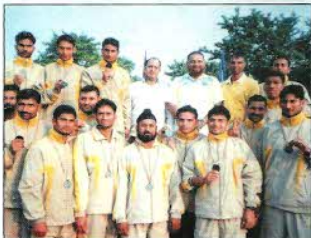
J&K Police Handball Team who secured Bronze Medal during 57 th All India Police Volleyball Championship held at Jalandhar Punjab from November 04 to 08, 2008 posing for a group photograph