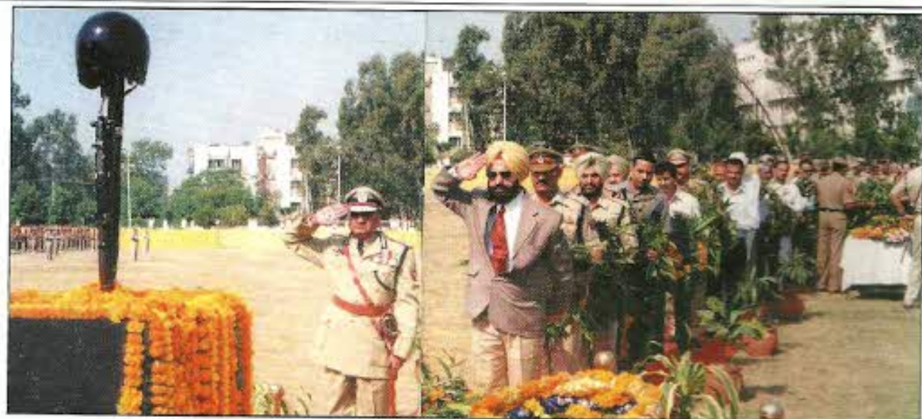
Senior Police officers paying floral tributes to the Police Martyrs on Police Commemoration Day at Jammu

present on the occasion beside other senior serving and retired police and civil officers and families of the police martyrs. As a mark of honour and remembrance, wreaths were laid on the Martyr's memorial.