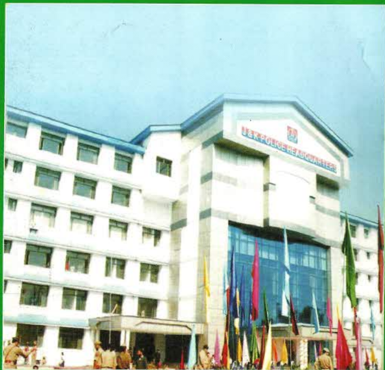
Newly constructed PHQ building at Srinagar inaugurated on October 09, 2008