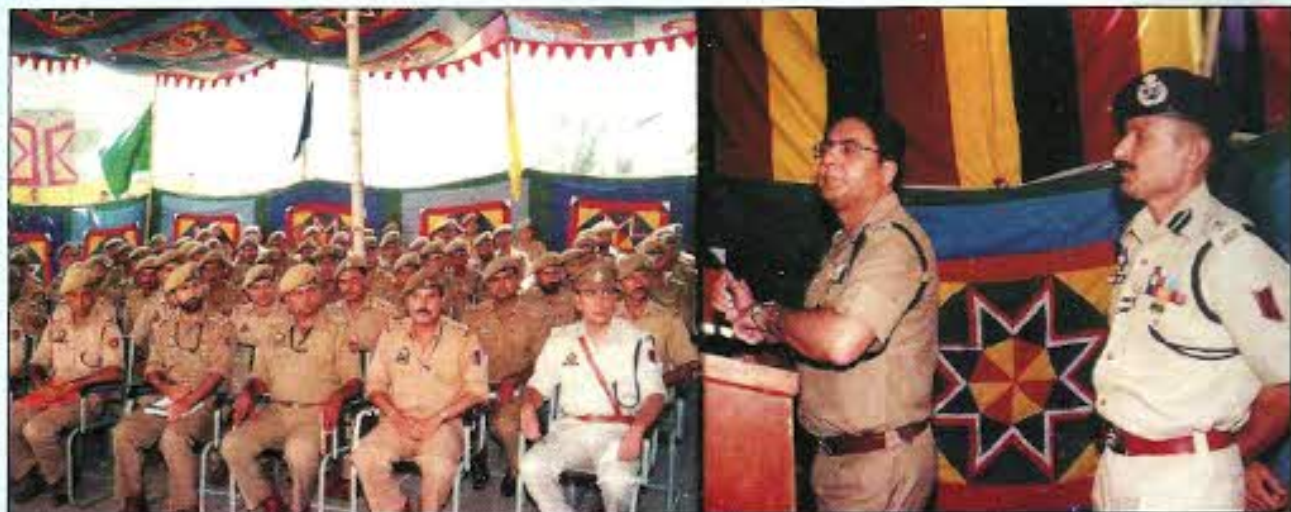
Shri Kuldeep Khoda IPS DGP J&K flanked by SSP Doda Shri Prabhat Singh addressing a Durbar of officers and Jawans at DPL Doda

The DGP also visited various areas of district Doda. During the visit, the DGP conducted a durbar of officers and Jawans to take the stock of the welfare measures of Jawans and the security situation of the area. During the durbar, the DGP patiently heard the grievances of the individuals and issued on spot instructions to concerned IGP/ DIG and district SSP present on the occasion for their redressal on merits. The DGP also inspected the arms/ammunition recovered by Doda Police from militants during the month..