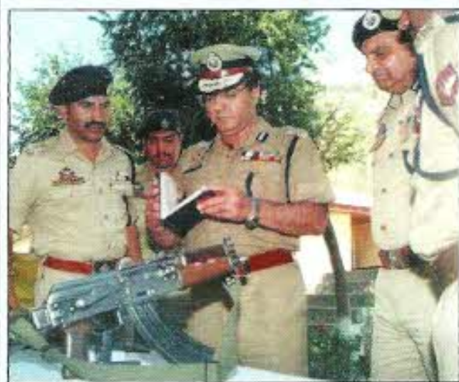
Shri Kuldeep Khoda IPS DGP J&K inspecting the weapons recovered from militants by Doda Police

■ During the months of October and November-2008 the major achievements of J&K Police in the anti-militancy operations include arrest of 16, surrender of 03 and elimination of 38 hardcore militants and recovery of huge quantity of arms and ammunition including 41 hand grenades, 06 IEDs, 33 AK-47 rifles, 72 AK-47 magazines, 2215 AK-47 rounds, 02 detonators, 11 wireless sets, 15 pistols, 19 pistol magazines, 296 pistol rounds, 03 .303 rifles, 41 .303 rounds, 01 SLR, 31 SLR rounds, 03 UBGL, 14 UBGL shells, 08 UBGL grenades, 24 Kg RDX, 07 pouches, 01 transistor, 04 mobile phones, Rs.15,000/- Indian currency, 35 remote control batteries, 35 mtrs. wire, 03 mortar shells, 04 charger, 05 SIM cards, 02 chinese grenades and 01 antenna.