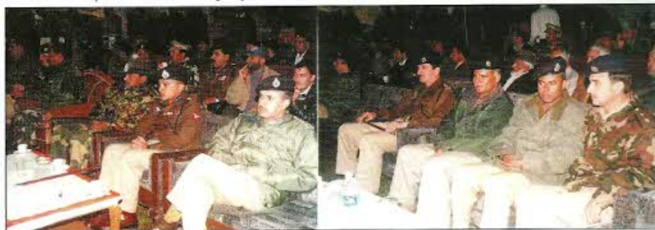
A Cross section of senior Police, Civil and Army officers witnessing the Passing out parade at STC Sheeri on October 15, 2008

The enthusiasm and patience of senior police officers to witness the Passing Out Parade and quality and standard of training imparted to these trainees can be well judged by the spirit and enthusiasm of trainees exhibited during POP despite harsh weather conditions and incessant rains throughout the function.