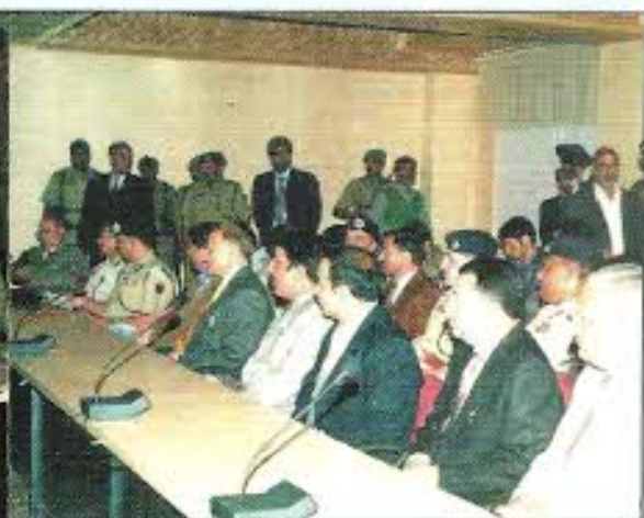
His Excellency the Governor of J&K Shri N.N. Vohra addressing a meeting of Senior Police officers at new PHQ Srinagar on October 09, 2008