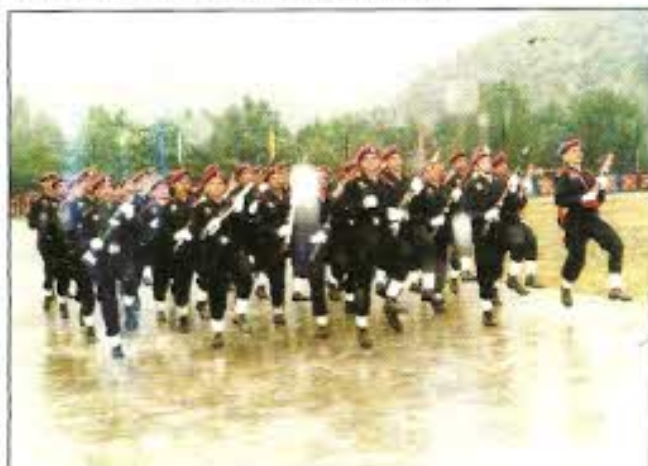
A Commando Platoon demonstrating its skills during POP at Sheeri