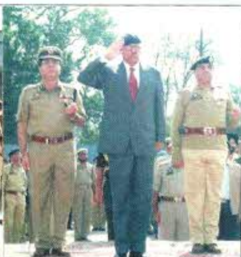
His Excellency the Governor of J&K Shri N N Vohra taking salute at the Guard of Honour at New PHQ building Srinagar on October 09, 2008