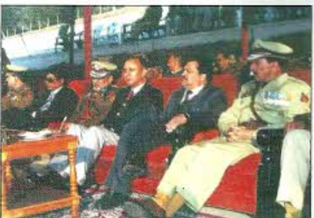
Senior Police officers witnessing the Police Commemoration Day function at Zewan Srinagar on October 21, 2008

Front Cover Photo caption : Shri Kuldeep Khoda IPS DGP J&K paying floral homage to Police Martyrs at the Martyr's Memorial at Zewan Srinagar on October 21, 2008.