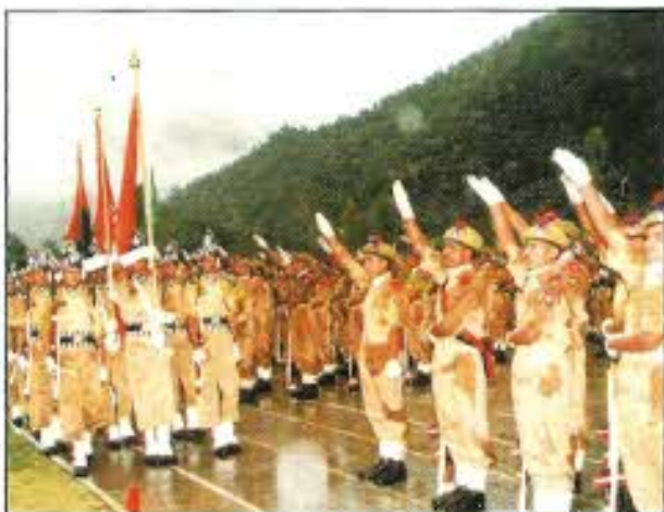
A view of Oath taking ceremony at STC Sheeri Baramulla