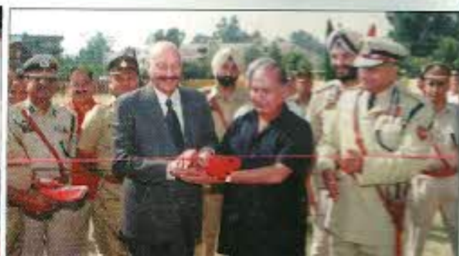
View of the blood donation camp held at Srinagar (L) and inauguration of the blood donation camp at Jammu(R) on the occasion of Police Commemoration Day