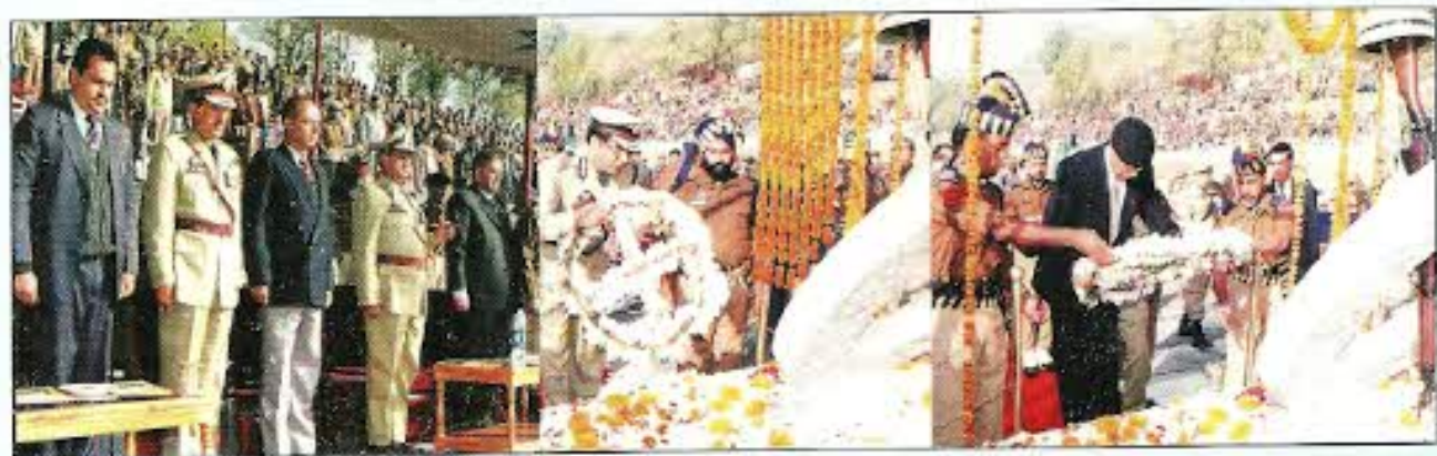
H.E the Governor and DGP J&K laying wreaths on the Police Martyr's Memorial in presence of senior police officers at Zewan Srinagar on October 21