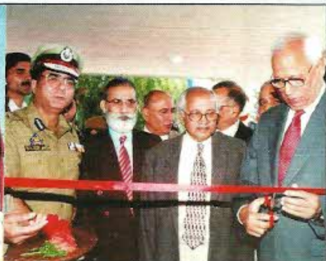
His Excellency the Governor of J&K Shri N.N. Vohra inaugurating the newly constructed PHQ building at Srinagar on October 09, 2008