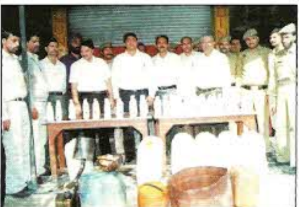
A view of Huge quantity of K-Oil seized by Crime Branch Sisuths from black marketers