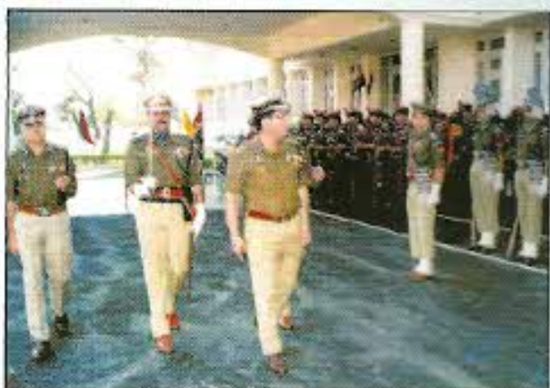
Shri Kuldeep Khoda IPS DGP J&K inspecting the guard of honour on the occasion of re-opening of PHQ at Jammu on November 10